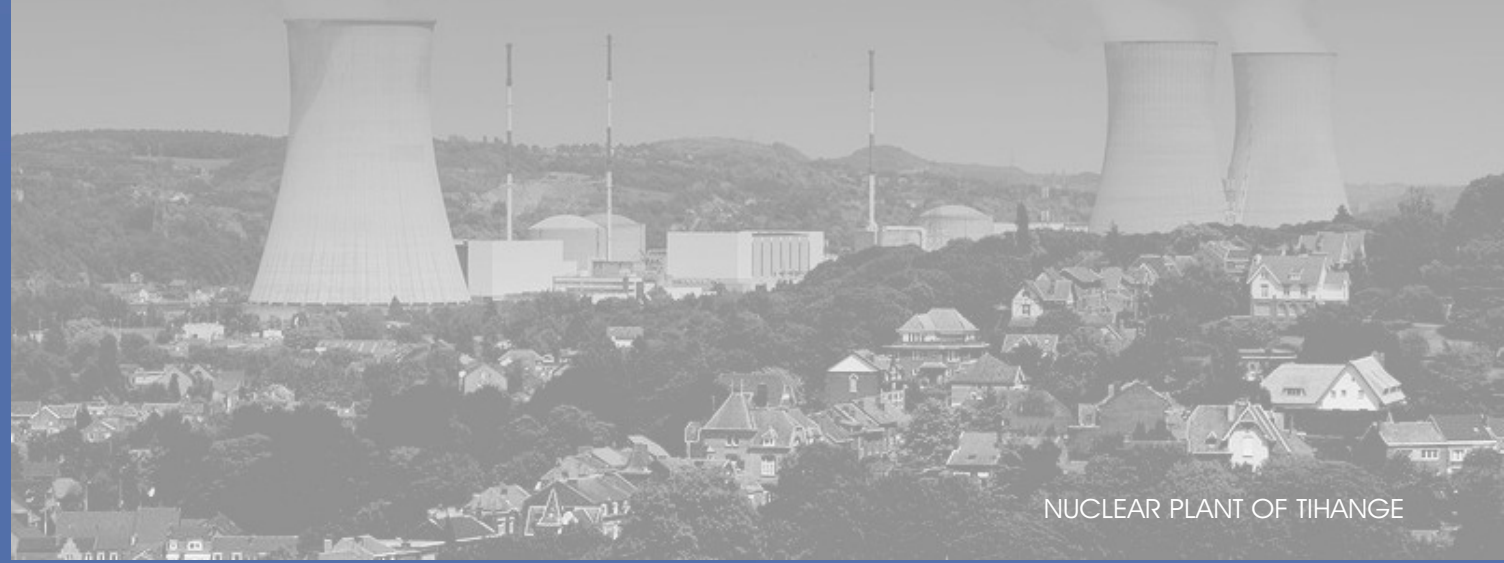
NUCLEAR PLANT OF TIHANGE

BalázsKovács (Hungarian Metal Workers'Union)