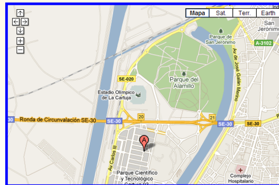
Google Maps image

The applications of CNA accelerators covers fields such as material sciences, environmental sciences, nuclear and particle physics and instrumentation and medical images treatment, biomedical research, among others.